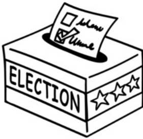
Taking Time Off to Vote