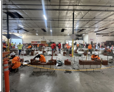
MCAC - MITA - BAC 4 Join Forces to Get California Apprentices to 2025 National Skills Contest